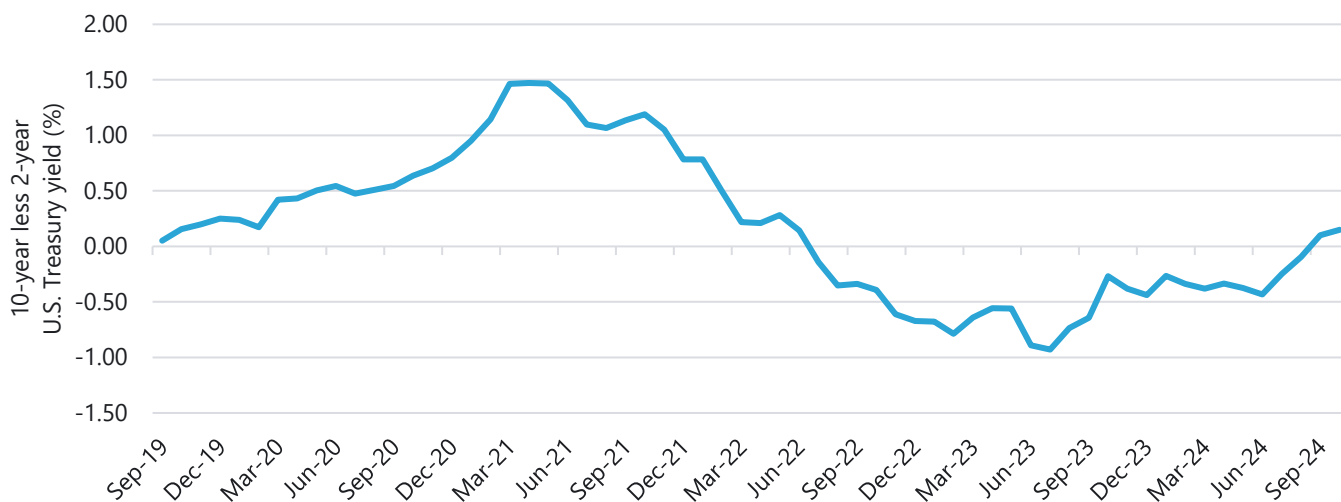
Exhibit 2: First positively sloped yield curve in more than two years

One of the key events of the third quarter was the sharp drop in interest rates as investors priced in central bank pivots around the globe. In the U.S. for instance, the yield on the 10-year note started the quarter at just under 4.50%, reaching a low of 3.62% just before the September Fed meeting. Interestingly, after the Fed lowered overnight rates, the 10-year yield rose to close out the quarter at roughly 3.75%. This combination of lower short-term rates but higher longer-rates finally reversed the two-year-long inversion of the U.S. yield curve. More importantly, we see this trend as the market beginning to question the effects of monetary stimulus and fiscal excess on longer-term yields. We couldn't agree more. We see upward pressure on longer-term rates in the U.S. even with additional interest rate cuts from policy-makers in 2024.