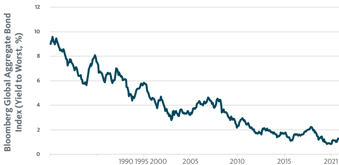
EXHIBIT 1: DECADES-LONG DOWNTREND

Monthly data spans 31/1/1990-31/12/2021.