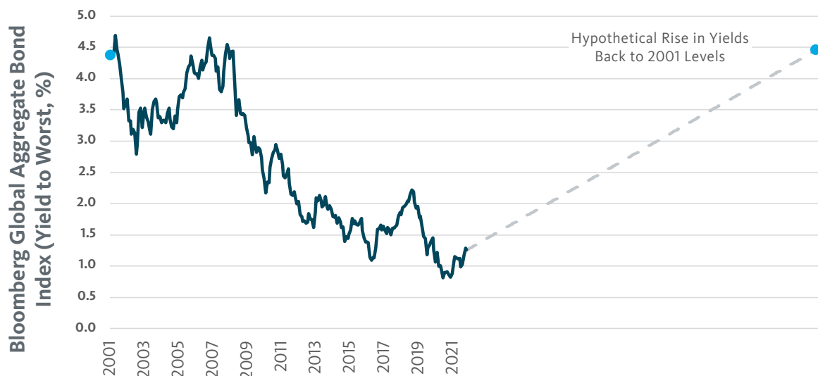
EXHIBIT 2: A BONDHOLDER’S WORST NIGHTMARE?

Monthly data spans 31/12/2001-31/12/2021.