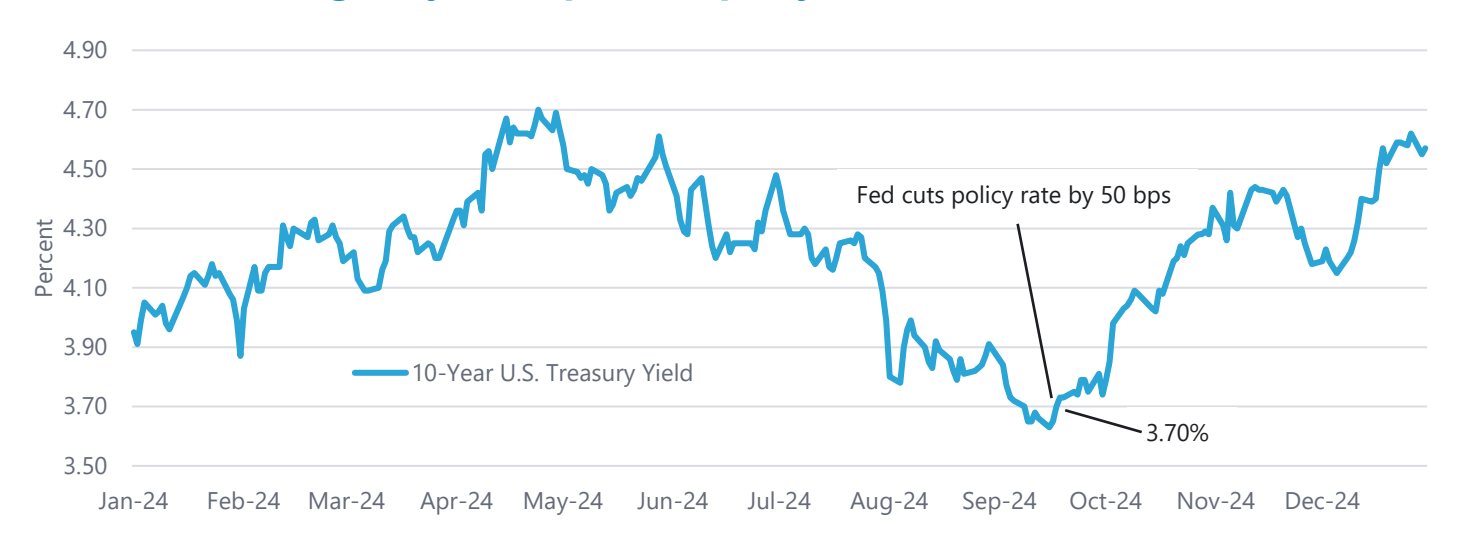
Exhibit 1: Will higher yields spoil the party?