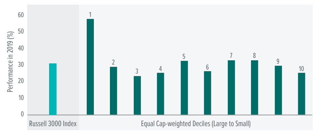
Exhibit 2: Largest-Cap Stocks Led Last Year

The recent plight of active management becomes clearer when we observe the difference in performance between the largest-capitalisation stocks and their smaller counterparts. Looking at equal-weighted deciles of the Russell 3000 Index (with each decile constituting 10% of the Index market cap), the largest stocks in the US market were in a universe of their own last year. Being so big, and appreciating so much, they rose far beyond the reach of almost all other market segments (Exhibit 2).