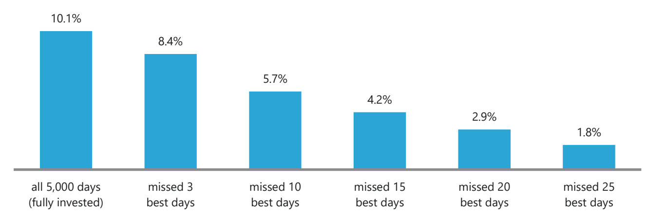
Exhibit 3: Annualized returns of S&P 500 Index last 5,000 trading days

We can demonstrate this by looking at historic stock market returns, progressively removing the best-performing days, and seeing what impact that would have had on overall returns. Exhibit 3 shows the results of this exercise using the 5,000 most recent daily total returns of the S&P 500 Index through April 9. Missing just the three best days over that period would have meaningfully lowered annualized returns, and that cost would naturally become greater the more of those large upside days an investor were to miss. If an investor had sat out the best 15-to-20 return days, they would have earned a return similar to what we tend to expect from bond holdings. And if we extended this thought experiment to the 25 best days (just 0.5% of the 5,000 trading days studied), annualized returns would have fallen below 2%.